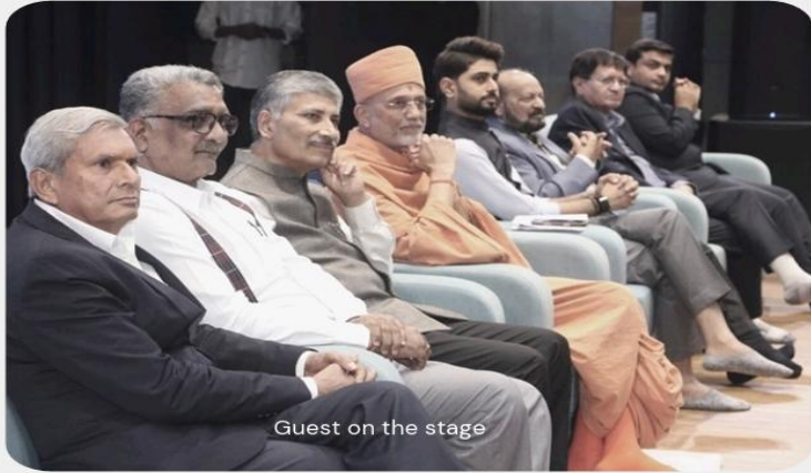
Guest on the stage