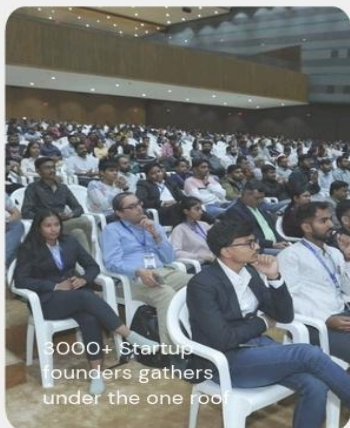
3000+ Startup founders gathers under the one roof